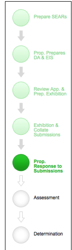
Figure 1 Project status

Figure 1 provides the current status and timeline for the Cabbage Tree Road project.